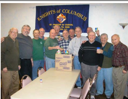
Social Group Collects food for St. Frances Outreach Food Pantry